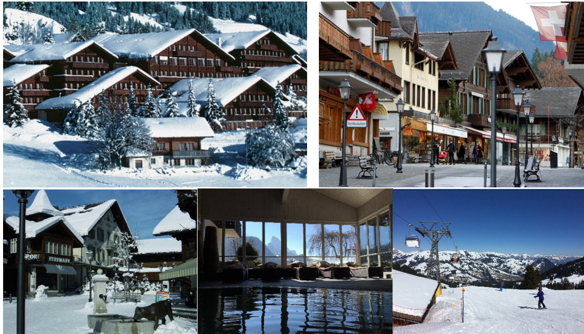
Clockwise from top left: Huus Gstaad Hotel, Saanen Village, Gstaad Village, Hotel pool, A huge skifield to enjoy.